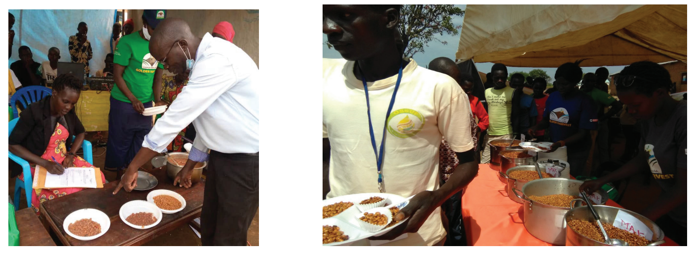
Figure 6: Organoleptic taste activity to select preferred bean varieties in West Nile

In this regard, the project conducted 'Organoleptic events' which involved cooking different varieties of a specific crop being promoted and allowing participants to taste them and provide feedback on specific attributes of personal interest to them. This feedback helped the LSBs determine which varieties they needed to concentrate on for particular communities. In the process, participants also gained insight into the other benefits of adopting specific varieties and how to access them.