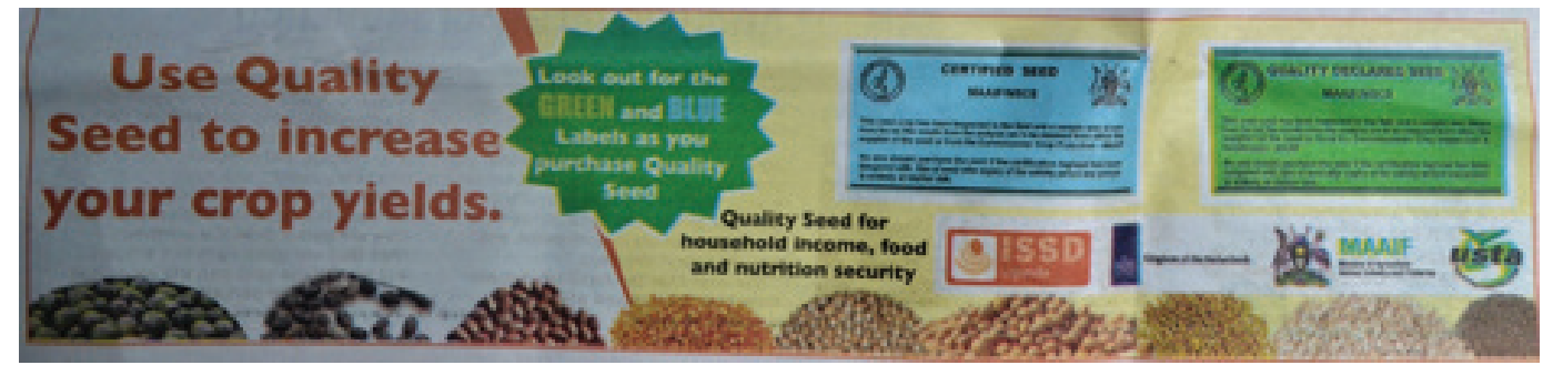
Figure 8: An ad promoting quality seed use in the New Vision newspaper (2019)

During the talk shows, radio stations gave LSB farmers, district agricultural officers (DAOs) and subcounty AOs a platform to enlighten listeners about quality seed use. Listeners were also given the opportunity to ask questions on the subject and they received contact information to discuss the matter further with the seed producers. Talk shows were also organised on selected local and national television stations in Uganda to promote quality seed use to additional viewer segments that play critical decision-making roles in the agricultural sector. Various LSB and quality seed use success stories were also disseminated through local and national newspapers to promote the importance of quality seed use.