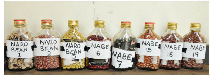
Figure 10: An assortment of the most farmer-preferred bean seed varieties

Results from the adoption study showed that the majority of farmers (64.5%) believed that LSBs gave them more variety options to choose from for OPV crops, thereby indicating greater dissemination of NARO varieties bred for various productivity and nutritional attributes.