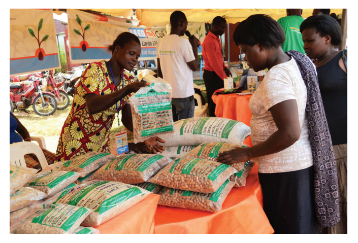
Figure 2: Farmer at a seed fair at Layibi Market, Layibi Division, Gulu District

The project facilitated local seed business (LSB) groups and seed companies to market quality seed during these seed fairs. These events were always held during established market days within farmer communities. The seed fairs were scheduled at the start of the rainy season, when most farmers make the decision to purchase seed for planting.