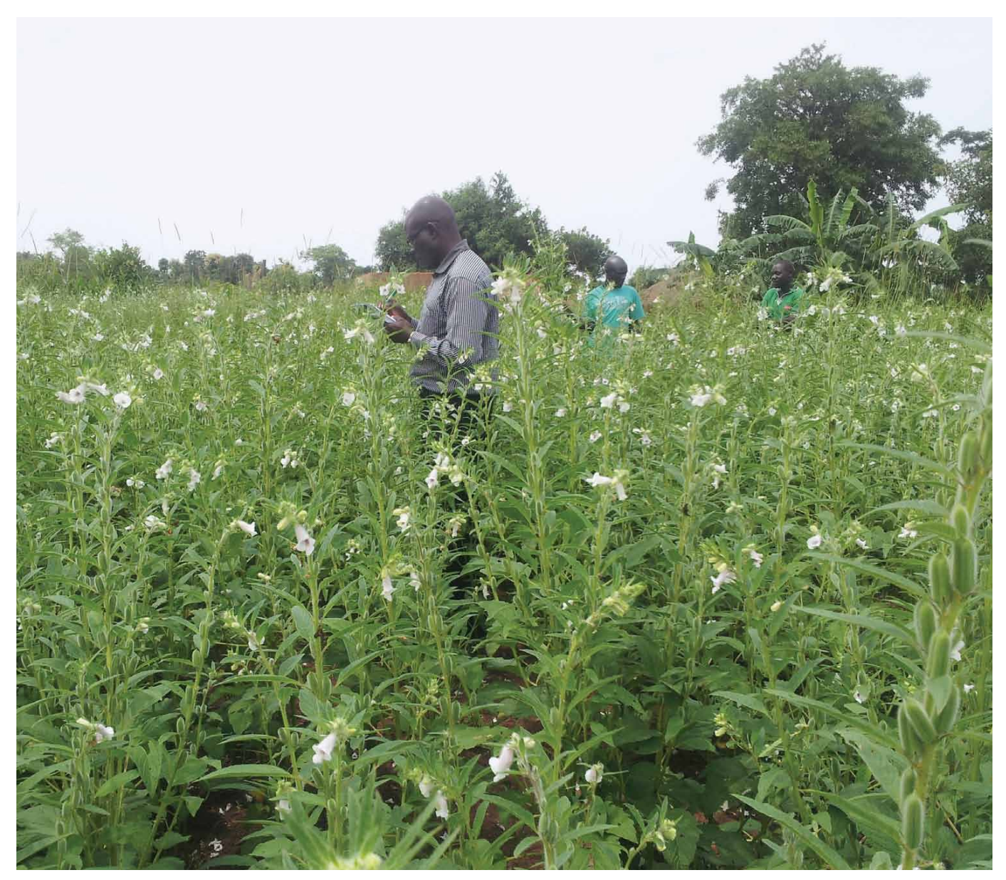
DAO Dokolo District Inspect sesame seed Field in Aye Medo Ngeca Dokolo district