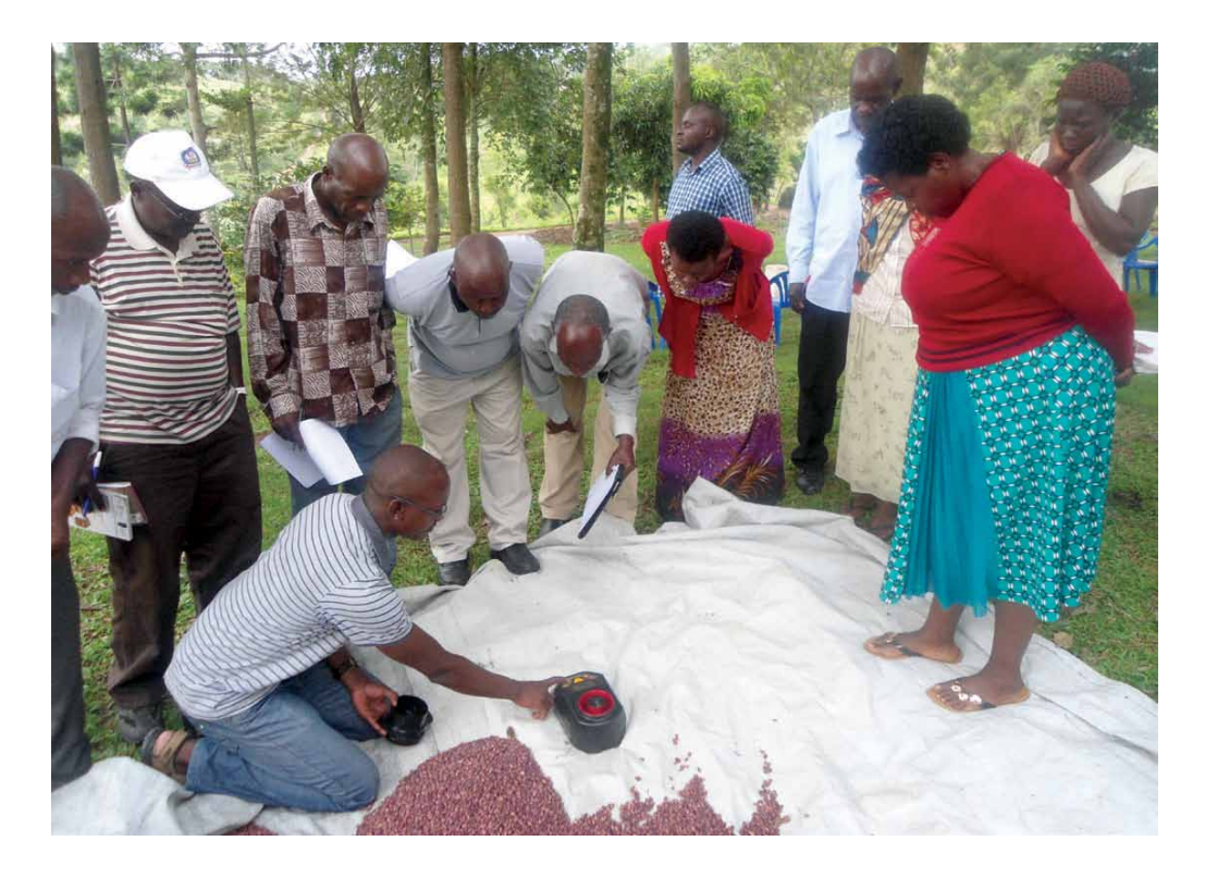
How to use a mois ture meter-Kazo LSB

ISSD Uganda's experience demonstrates the informal seed sector's ability to increase the availability and variety of quality seed for desired crops to local farmers, including those located in areas where formal seed producers are not available. Since its inception, ISSD Uganda has focused its support on seed market supply with little input on seed uptake and the demand side. To maintain an equilibrium in the quality seed market, ISSD is in the process of conducting awareness campaigns on the use of quality seed (both certified and QDS) at the national and zonal level. This will bring the programme even closer to attaining its goals of: 1) increasing quantity of food produced from seed; 2) increasing farm income due to farming households using quality seed; and 3) increasing farm income of LSB members engaged in quality seed production and marketing.