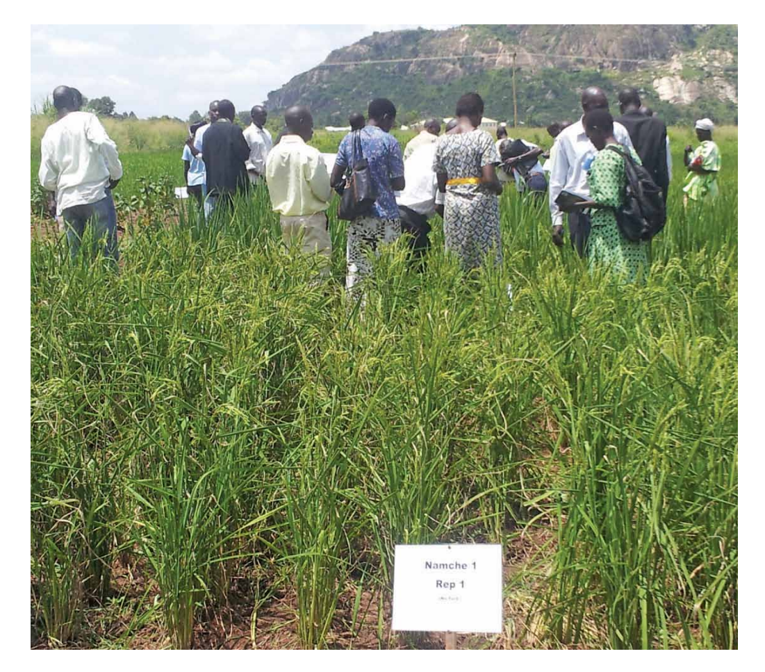
LSB farmers vote for their favorite varieties during on station field day organized by ISSD at Ngetta ZARDI

Most seed companies in Uganda - comprising the formal seed sector - are mainly interested in crops with high profit margins (higher multiplication ratios) such as hybrid maize. Self-pollinating crops, which are the major food crops, are not normally considered by the formal sector. ISSD Uganda hopes to bridge this gap by engaging farmers in seed entrepreneurship through the LSB model. ISSD Uganda is working both directly and indirectly with about 100 LSBs to produce quality seed of locally adapted crops and varieties for local markets; this seed falls under the quality declared seed (QDS) class. The LSBs fill the gap in quality seed production for crops such as beans, groundnut, simsim and sorghum, which commercial seed companies are not sufficiently involved in.