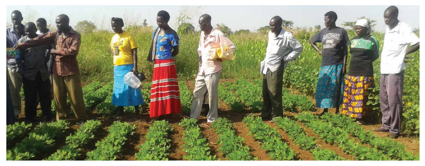
Farmers at a field day at a LSB demo garden

2 ISSD has engaged in policy dialogue that has successfully led to the recognition of QDS as a seed class under the draft 2014 seed policy, draft national seed strategy, and the national agricultural development plan 2015/16 – 2020/21.